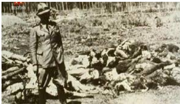
A Fascist standing in front of Ethiopian victims