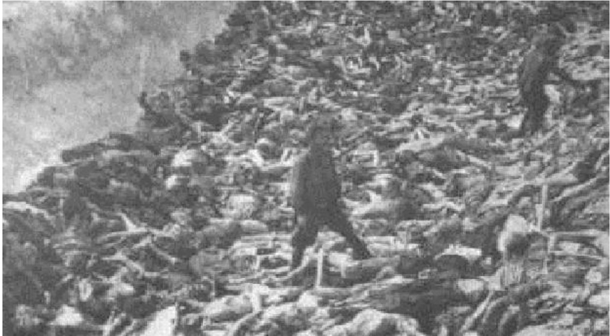
Victims of Fascist mustard poison gas