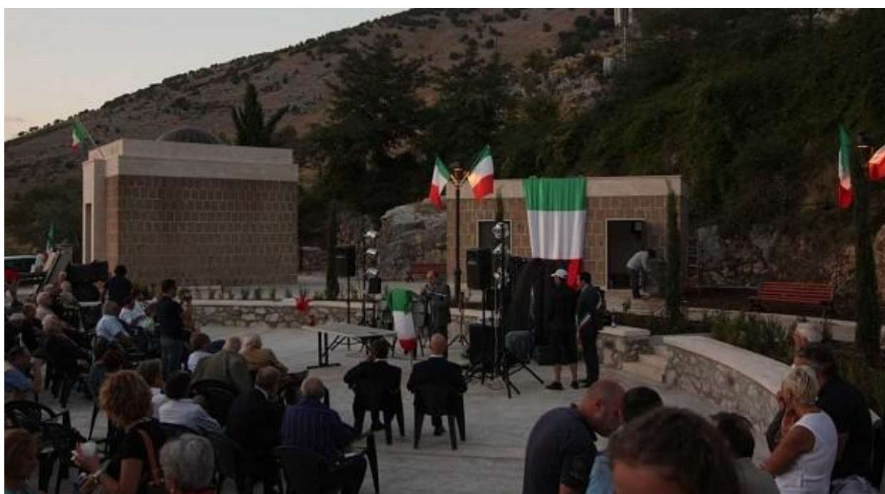
Graziani's mausoleum being inaugurated in August, 2012.

With regard to the Graziani mausoleum, Lazio Regional Council's legal action is being awaited in order to remove his name from the monument as a war criminal does not deserve such an honour under current Italian laws.