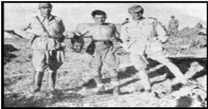
Fascist soldiers showing off the head of an Ethiopian patriot