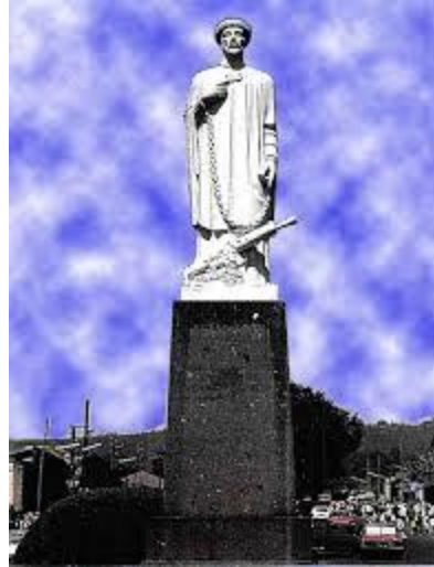
Statue of Abune Petros 22